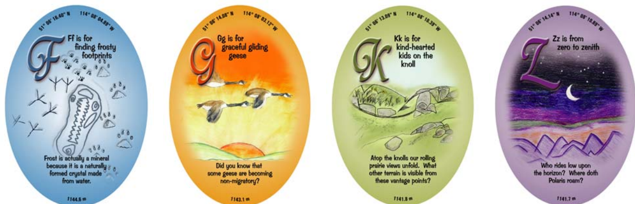
Figure 3. Additional examples of Alphabet Panels with geoscience content

However, on Ff is for frosty footprints, the observer is directly told that frost is a mineral, and the definition of a mineral is invoked in the balance of the comment. This sign has given rise to more comments of, "Huh; I didn't know that!" than any other sign. Sometimes facts are fun, and expand knowledge through wonder. It is also paired with the visual metaphor of our ecofootprint, moving in proportion and direction with our natural environment. The did-you-know comment regarding non-migratory geese opens a dialogue on anthropogenic climate change, and knolls and night skies provoke an examination of our place, both on the ground and in the heavens.